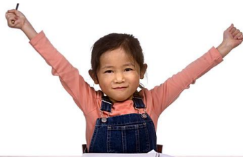
Building a Culture of Quality Data for Student Success